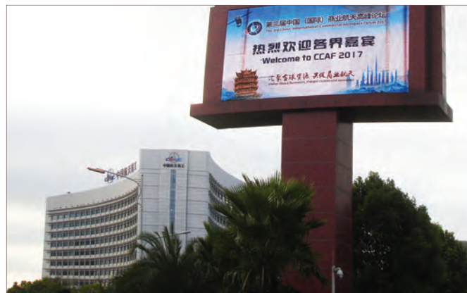
The CASIC Wuhan administration, just across the hotel.

Almost all speeches and presentations given during the forum by Chinese representatives reflected on this unique project: the National Space Industry Base in the Yangluo Economic