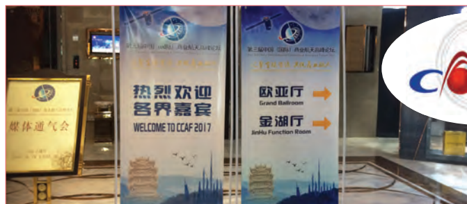
Welcome to the CCAF 2017.