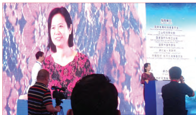
Deputy Mayor of Wuhan, Ms Liu Yingzi.

Opening remarks came from officials of all levels of political life. On the municipal level, Liu Yingzi, the Deputy Mayor of the town of Wuhan gave an enthusiastic, welcoming and highly encouraging speech. She stressed that the Wuhan National Space Industry Base is one of the top priorities of the municipal administration. She is convinced that the aerospace industry