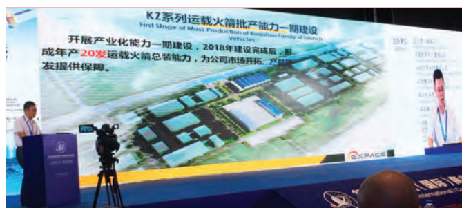
Zha Xiongquan showed an overview of the Expace buildings for the mass production of the Kuaizhou launcher.