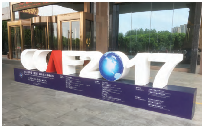
Entrance to the conference hotel.